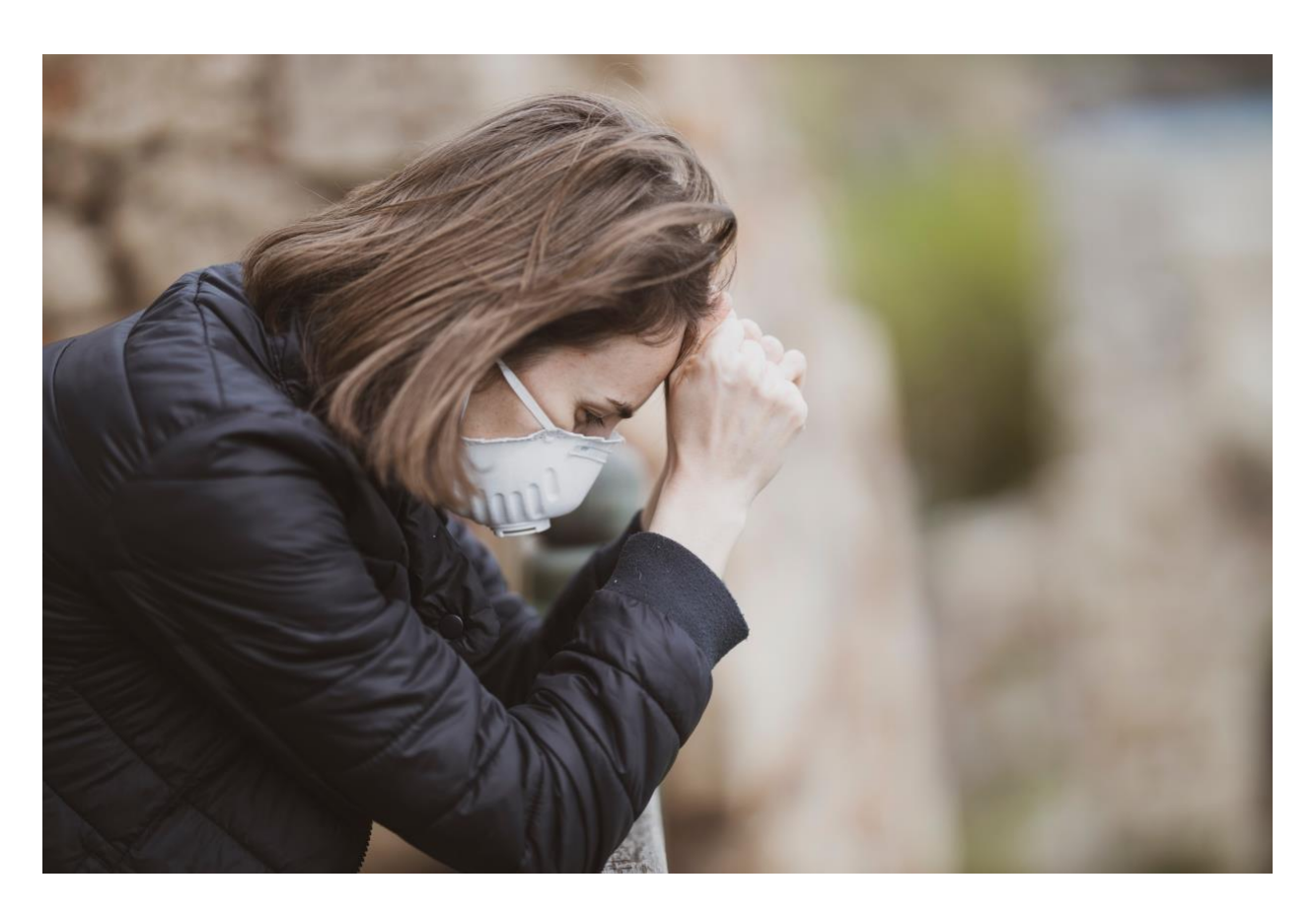
This toolkit was made in partnership with the New York Life Foundation. Updated May 2021.